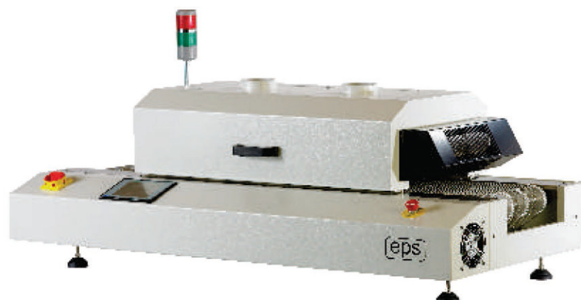
RF 300 Inline